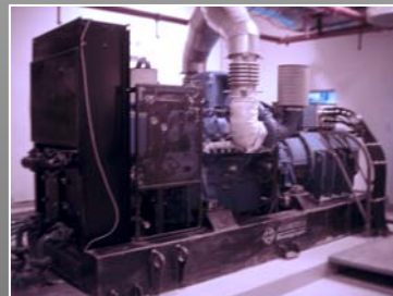
table cooler, EDG